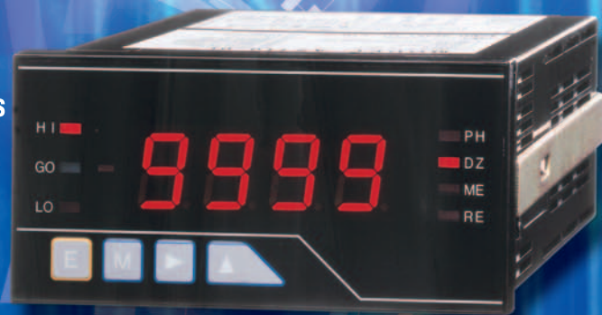
Display single type (A5X1X-XX)