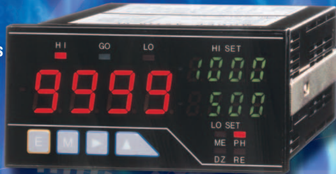
Display multiple type (A5X2X-XX)